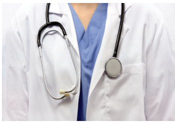
Hospital & Medical Facilities